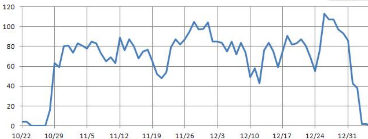
13th TCS Officers and Enlisted Men on Noemfoor