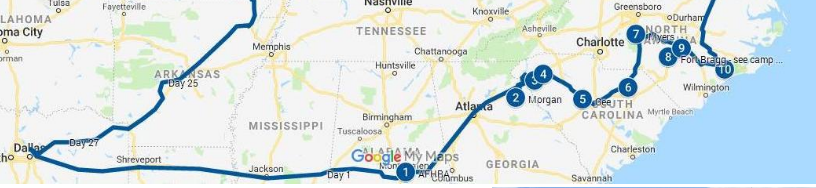
Day 1 (May 29): Dallas to Montgomery, Ala. – Driving 10:05, 618 Miles

At the Louisiana Welcome Center I learned about the Chenault Aviation Museum in Monroe, La., next to I-20. This is in the building at right, which was part of the Selman